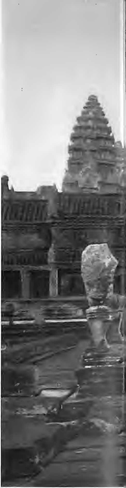
Head of State Samdech Sihanouk in front of Angkor Wat — symbol of Cambodia.